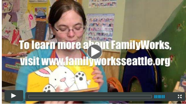
The Power of Play

You can find other posts from the FamilyWorks blog here and here .